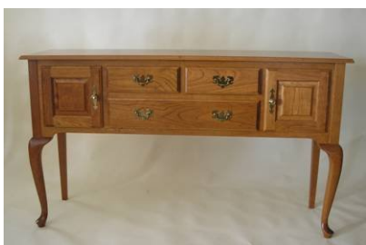
Queen Anne Huntboard

The Buffet provides a superb focal point for those whose entertaining style leans toward the casual. As a buffet table or a place to repose multiple courses, the longer buffet cabinets provide ample space for quite a spread. As with the sideboard, serving utensils and "good" flatware store handily in the shallow drawers (with optional silverware liners). Larger serving dishes and other utilitarian miscellany find their place behind the ample lower doors, where, though hidden from view, they are readily available.