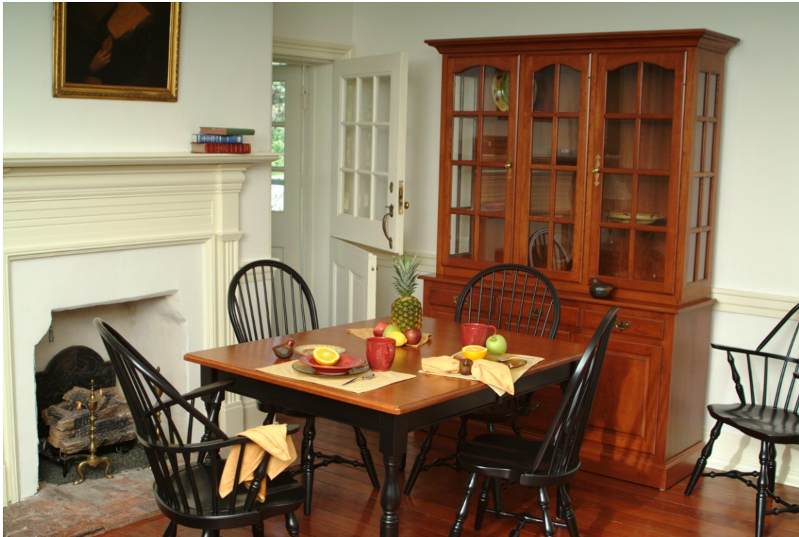
Custom Colonial Dining Room Furniture by American Heirloom Furniture (Featuring Heritage Colonial Sideboard Cabinet With China Cabinet Top)

Do You appreciate beautiful hardwood furniture built by craftsmen to last for generations? Are You seeking just the right cabinets to grace Your dining room or kitchen? If so, read this Furniture Buyers Guide To Heirloom Quality Dining Cabinets