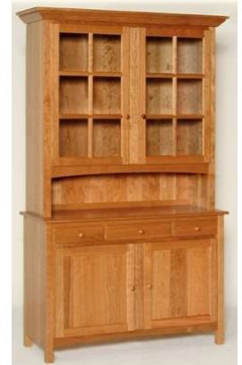
Shaker Style (right)