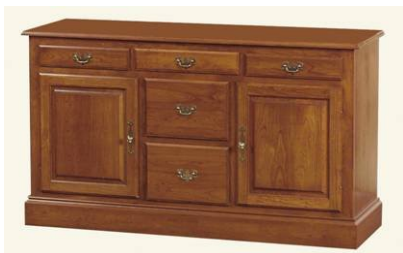
Heritage Colonial Sideboard

Floor-standing lower cabinets ordered by storage capacity: