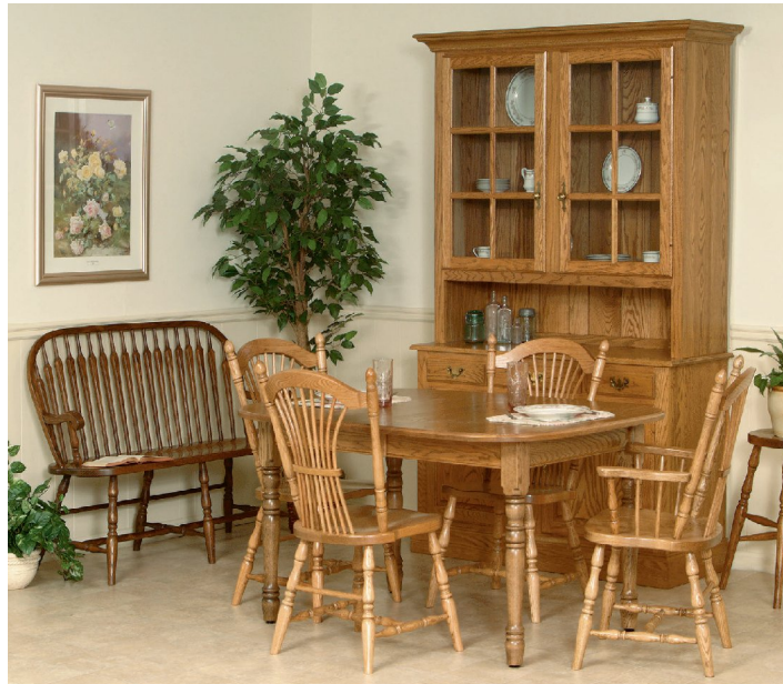
Heritage Colonial Dining Room Combination By American Heirloom Furniture