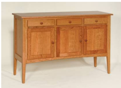
Heritage Shaker Buffet

The Sideboard is the work horse of the dining room. For the space it occupies, it provides more practical storage space than any other cabinetry piece. Serving utensils and "good" flatware store handily in the shallow drawers, which, by the way, can be provided with optional silverware liners. Larger serving dishes and other utilitarian miscellany find their place behind the ample lower doors, where, though hidden from view, they are readily available.