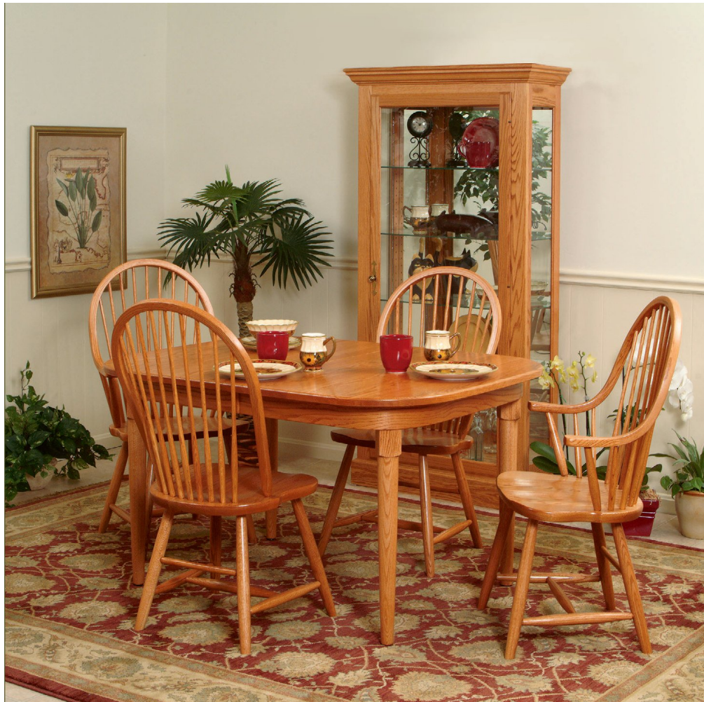
Heritage Colonial Curio Display Cabinet by American Heirloom Furniture

Furnishing styles and tastes continuously evolve, but throughout the decades no dining room could ever be considered complete without some form of cabinetry. Colonial, Shaker, Mission... there are many different styles of dining room furniture available to us from our rich heritage of North American furniture craftsmen.