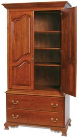
Heritage Colonial Armoire (Cherrywood)

Armoires - are tall storage cases consisting of drawers below, with either shelf storage above (termed armoires) or rod hanging space above (wardrobes). A shaker wardrobe cabinet is termed a "Clothes Press".