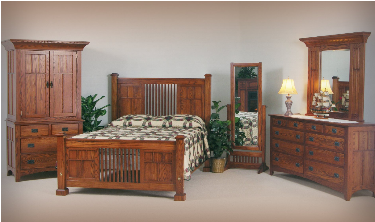
Custom Mission Bedroom Suite by American Heirloom Furniture

Do You appreciate beautiful hardwood furniture built by craftsmen to last for generations? Are You seeking just the right bedroom chests to grace Your sleeping chamber? If so, read this Furniture Buyers Guide To Heirloom Quality Bedroom Cabinets