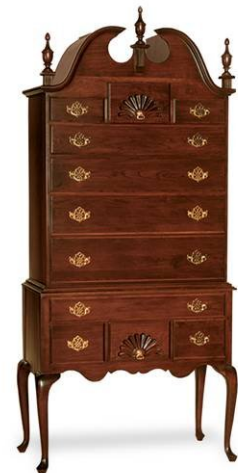
Heritage Queen Anne Highboy (Cherrywood)

one to open the lower drawers without having to bend over. It was also popular with one's staff, as it allowed them to clean under it with ease.