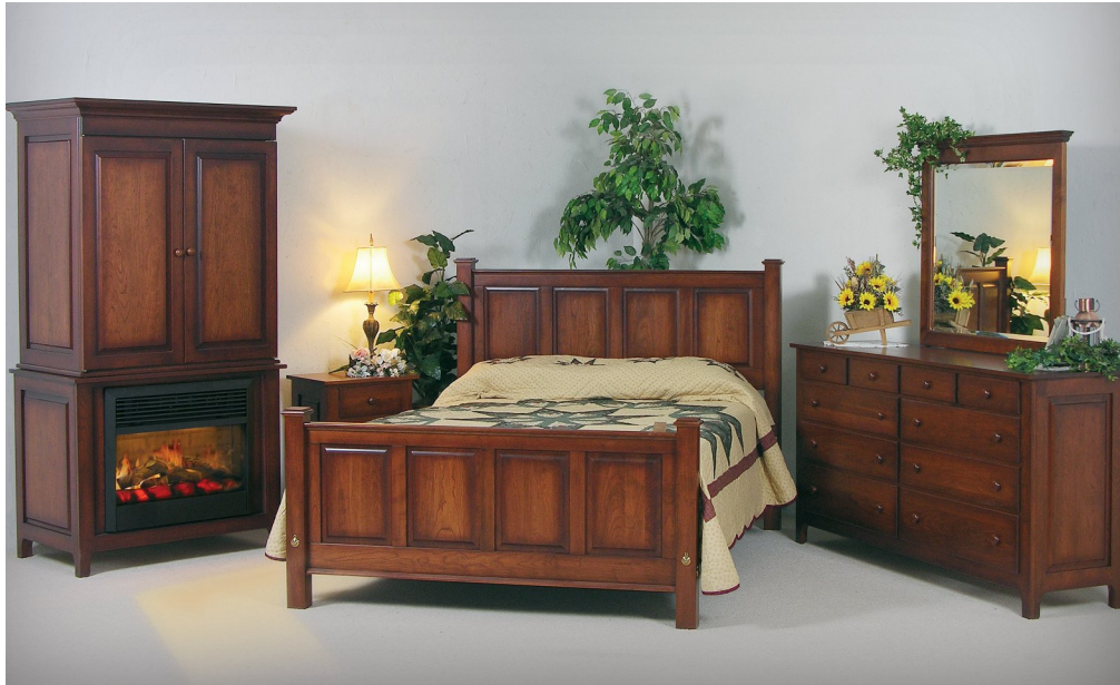
Shaker Bedroom Suite by American Heirloom Furniture