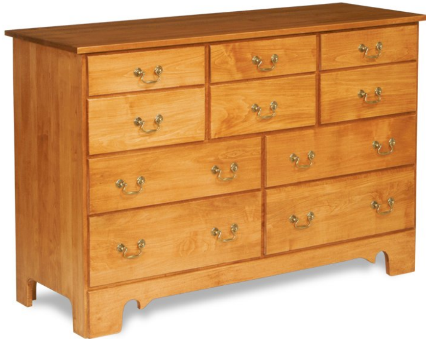
Heritage Shaker Triple Dresser (Maple) by American Heirloom Furniture

Furnishing styles and tastes continuously evolve, but throughout the decades no bedroom could ever be considered complete without some form of cabinetry. Colonial, Shaker, Mission... there are many different styles of bedroom furniture available to us from our rich heritage of North American furniture craftsmen.